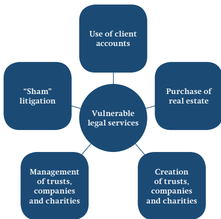
Figure 2: Money laundering and terrorist financing – susceptible legal services 37

FATF has identified certain legal services, though not necessarily accepted by the legal profession, as particularly susceptible to misuse by criminals in the context of money laundering and terrorist financing: