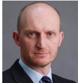
John Kennedy S.C.