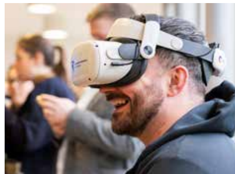
Trainees try out the Courts Services Virtual Reality experience.