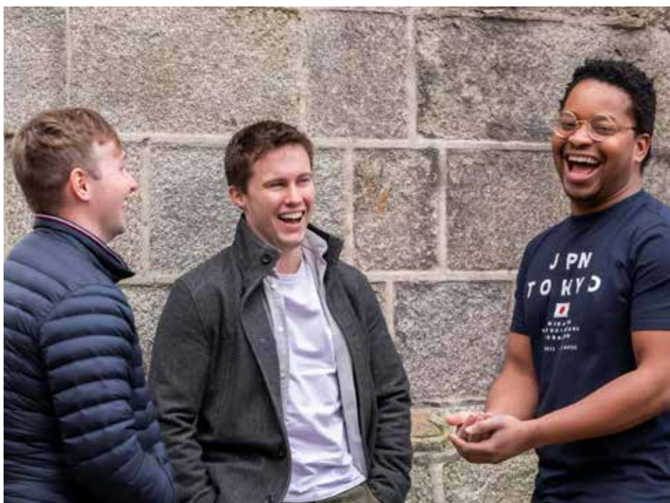
Trainees learn about technology and the law, strategies for Climate Justice, AI, and the challenges facing the profession.